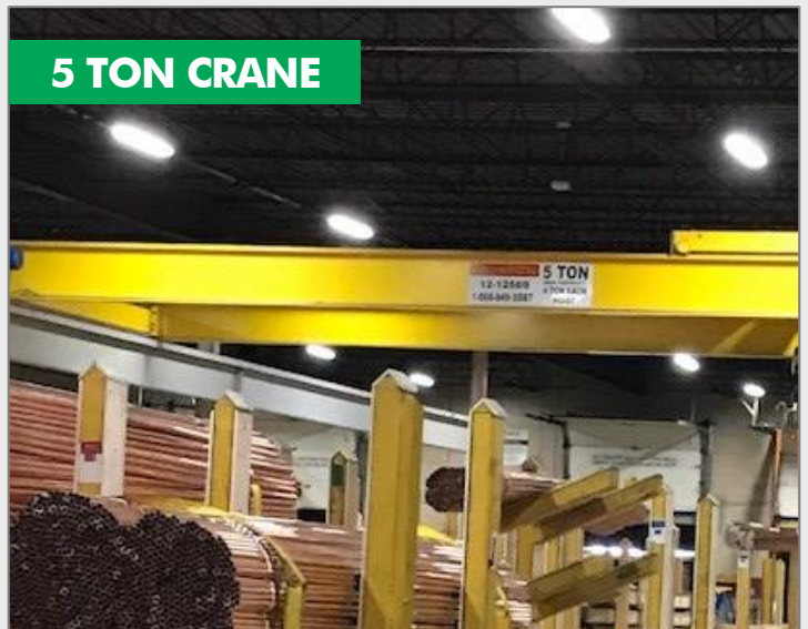
5 TON CRANE