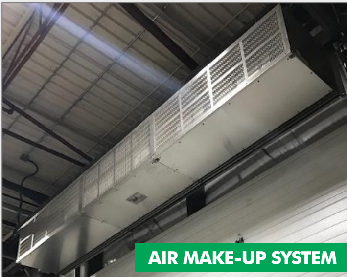
AIR MAKE-UP SYSTEM